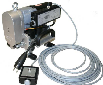
Remote Control K9-1-KF