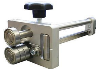
Mini-Bender3 200 91544 Mini-Bender3 350 91544S3