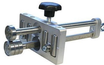
EcO-Bender3S1 91545S1 (200 mm, without O-handle) EcO-Bender3S4 91545S4 (350 mm, without O-handle)

Video „how to fabricate standing seam panels“ available online!