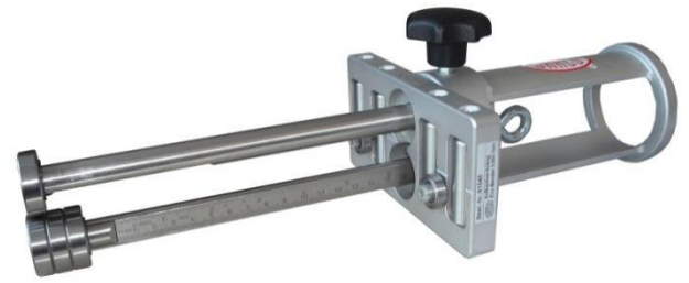
EcO-Bender3/200 mm #91545 / EcO-Bender3/350 mm #91545S3

3 optimum gripping positions and always good grip, no matter how far the rod is pulled out: