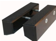
set of blocks, for straight cutting of corrugated plastics, BG 20065