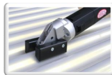
Slitting of corrugated polyester with optional guide BG20065