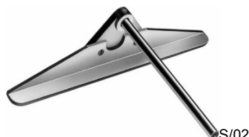
adjustable guide for cutting strips or edge-bands