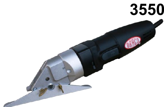
Quick on & off side guide for flush trimming