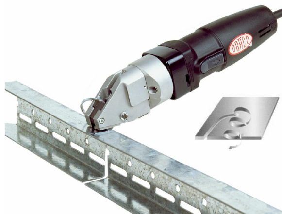
Dry wall Metal stud / UA-profiles