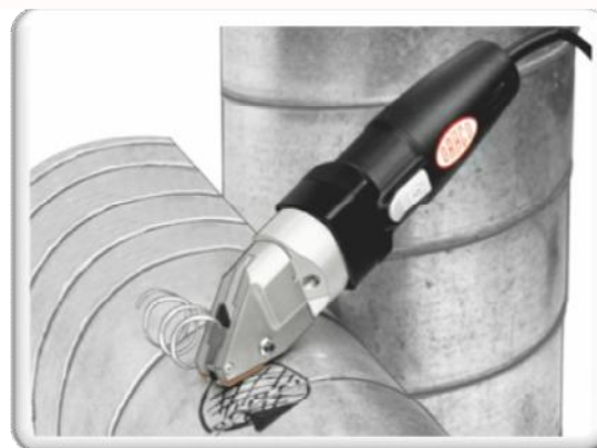
starting hole 12-14 mm Ø accurate cutting along a marked line