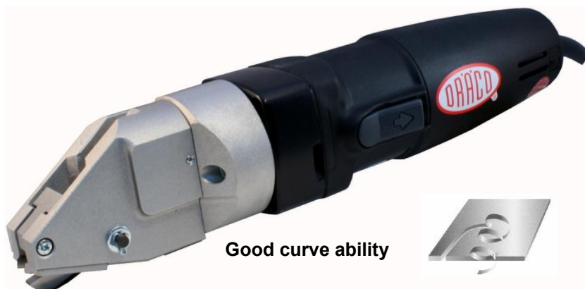
Good curve ability