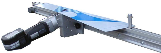
Slitter attachment K1-LSE for decoiler or workbench