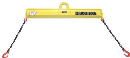
Lifting Traverse K1-CWT