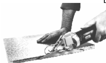
flush trimming of projecting edges with side guide