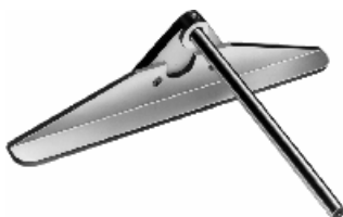
S/02 adjustable guide for cutting strips or edge-bands