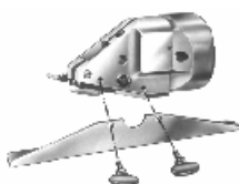
assembling side guide with two wing screws