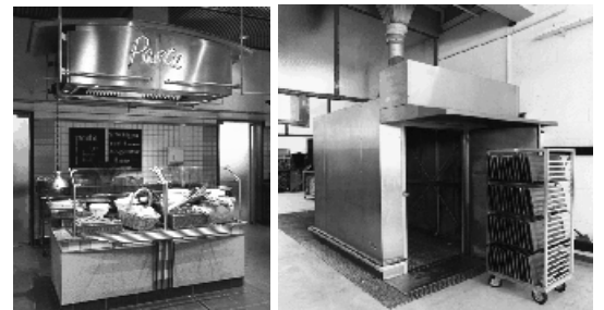
Refrigeration & Cleaning Equipment etc.