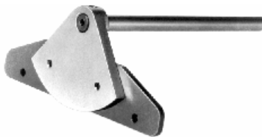
adjustable guide S/01 for straight cuts